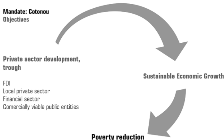
Chart 2: EIB supporting development – visualisation

Privatisation can be said to be another objective (and closely connected to the previous one) through which EIB seeks to contribute to development. It is not usual that EIB would provide some elaborate justification for its developmental reasoning or would engage in discussing the historical development of the development economics discipline. However, in one of such rare occasions, the Bank tries to make a historical excursus into understanding the role and performance of private sector versus public sector. 35