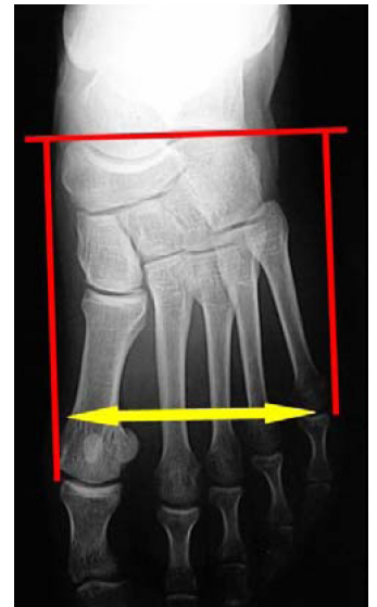
Figure 2 – Forefoot width measurement method.

In the statistical analysis, the quantitative variables were represented by the mean, standard deviation (SD) and maximum and minimum values, while the qualitative variables were represented by absolute frequencies (n) and relative frequencies (%).