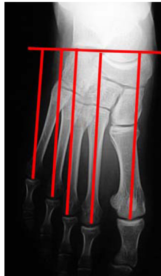
Figure 1 – Metatarsal length measurement method.

most distal point of the head of each metatarsal, and measured these distances in millimeters (Figure 1). The width of the forefoot was measured as the distance between two straight lines perpendicular to the Chopart joint, tangential to the most medial and most lateral points of the heads of first and fifth metatarsals, respectively (Figure 2).