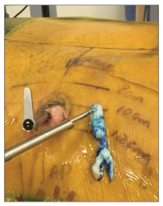
Fig. 3 Removal of the extruded disc fragment.