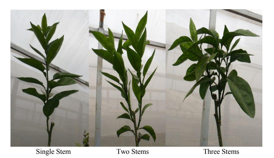
Figure 1. Leading systems for the parent plant buds of the 'Pera' and 'Valencia' orange trees in a modified hydroponics system.