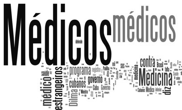
Figure 4 Tree of most mentioned words in news headlines.

Figure 4 reflects the most mentioned words in the headline news from Folha de São Paulo and Correio. The words represent larger ones that appeared most frequently in this way may be noted that the term most often cited was “Doctor” because of the theme and choice of descriptors for the news. The titles were more related to problems of corporate conflicts between Brazilian and foreign doctors. We notice that the word “against” assists in finding that most publications is negative slant.