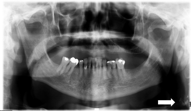
Figure 1. Well delimited radiopaque image on the left side close to the intervertebral space C3 and C4 (arrow).

For differential diagnosis between atheromas and other types of calcifications with some radiographic similarity, the option was taken to perform the Manzi Projection, an anterior-posterior projection performed in the cephalometric unit with the Kodak Ceph 9000 3D apparatus (Carestream Health, Inc.), in which the patient is positioned with the Frankfurt plane slightly inclined (between 15-30°) towards the vertical position. On performing the exam, the presence of a radiopaque mass was verified on the left side, site of the carotid trajectory, compatible with calcified atheroma in the carotid artery (Figure 2).