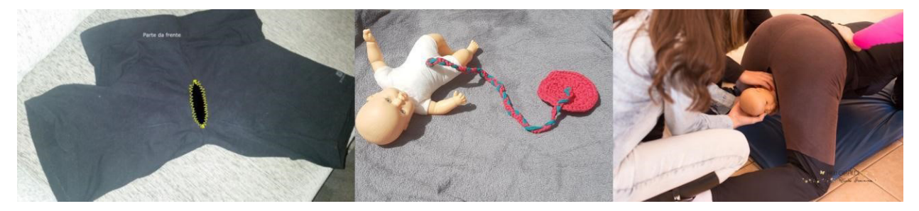
Figure 1 - Birth simulator shorts with a doll (short with sewing scheme, baby doll with crochet placenta and shoulder dystocia simulation)

One student or actress wears the shorts and may experience the birth, while another student may attend the birth, identify and manage dystocias. This simulator allows the training of skills and attitudes related to normal delivery care, resolution of dystocia and obstetric complications (particularly useful for dystocia requiring a maternal change of position). It was also used for the discussion of models of care and communication skills, as it allows apprentices to play the birthing person role. It is a low-cost solution with a final cost of approximately USD 26.91 (conversion rate of 1 USD = BRL 3.97, as of May 29, 2019) and allows the presentation and simulation in various environments - schools, pregnant women groups, and professional training environments.