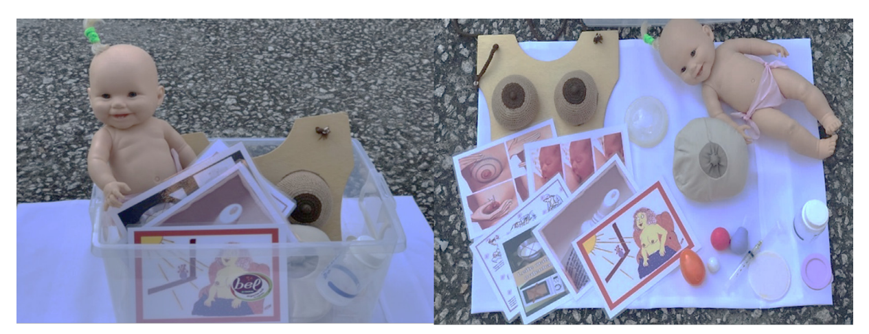
Figure 2 - "Kit Educativo em Aleitamento Materno" (KEAM) São Paulo, SP, Brazil, 2018

Based on the diagnosis of these problems, the development of the KEAM (Figure 2) focused on the selection of materials available in the market and easy to sanitize, consisting of 15 items identified by the main researcher as strategic instruments to prevent misunderstandings of certain guidelines and/or inadequate execution of medical prescriptions.