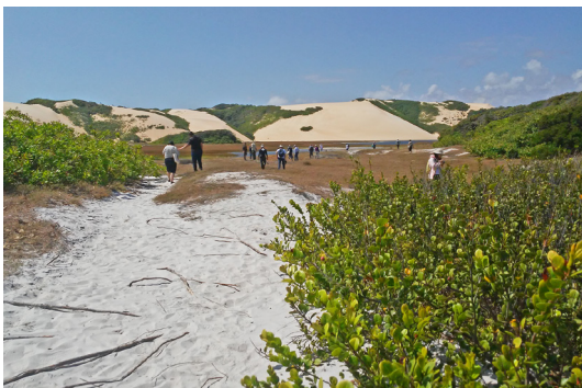
Figure 14 – Monocots VI attendees visiting the Environmental Protection Area of Jenipabu, in Extremoz.