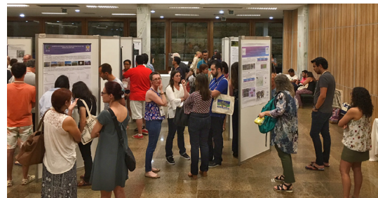
Figure 8 – Attendees during a poster session.

Some host candidates requested that the next election should be restricted to Asia and Africa, which have not hosted any Monocot conference so