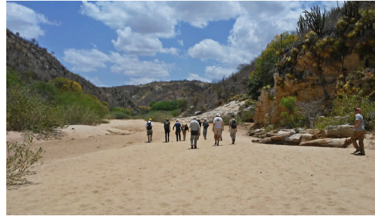
Figure 15 – Monocots VI attendees visiting an area of inselbergs within the Caatinga, in the Seridó region.