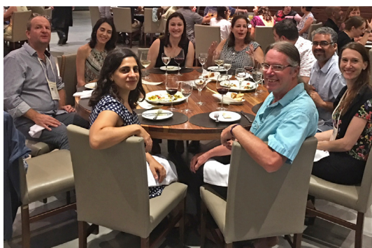
Figure 10 – Monocots VI attendees during the Gala dinner.

Our feeling, supported by informal talks with colleagues who attended Monocots VI as well as by some commentaries which were publicized in social media and blogs (e.g., Woudstra & Veltman 2018), is