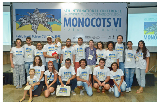
Figure 16 – Part of the Monocots VI team and UFRN herbarium students.