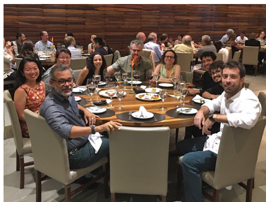
Figure 11 – Monocots VI attendees during the Gala dinner.

that Monocots VI accomplished its objectives, with an intense scientific and social program, diversified attendance, as well as growing and broadening the scope. Even participants from areas less represented, such as Economic Botany, Biotechnology, and Crops, left very positive comments, which suggest to us that the Monocots will become an even stronger and more integrative event for all subjects involving these important plants (Fig. 1). Also, a great number of young researchers were able to attend and network, several of them from UFRN (Fig. 16). Additionally, the herbarium UFRN was visited by a considerable number of specialists, what improved identifications of specimens, and received many book donations, increasing its library. We are thankful to all attendees, symposium organizers, speakers, students, and funding / supporting agencies (Fig. 16).